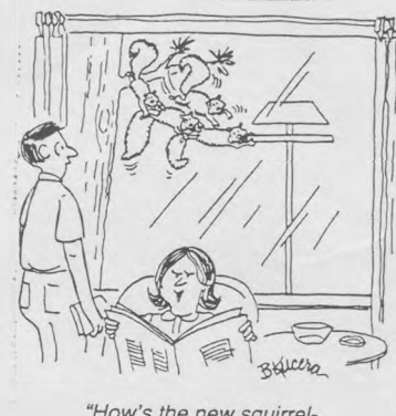
"How's the new squirrel-proof feeder working?"