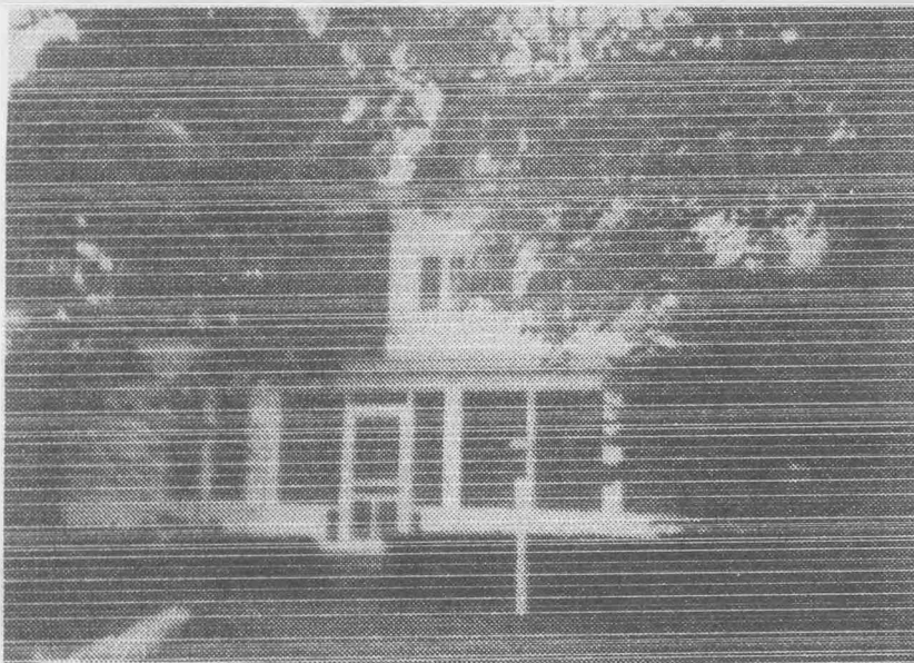
The Rorden Home will be the scene of "Sentimentality and Romance" during the Rake and Hoe House Tour Dec. 3.