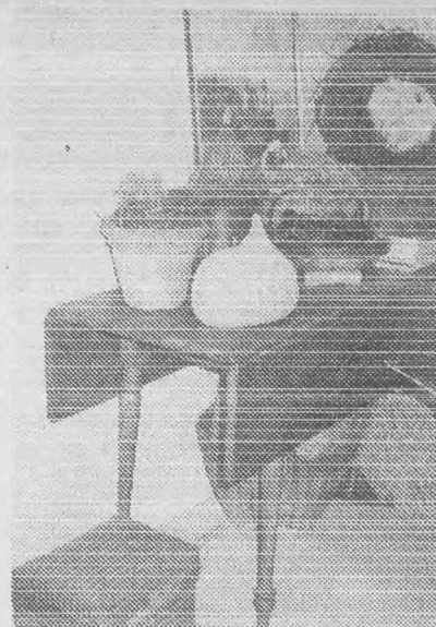
An antique drop leaf table holds baskets, pottery and other antiques surrounded by dried flowers and wreaths in the Tittle's plant room near the kitchen.

In the dining room fresh flowers will coordinate with the collection of china. The back hall, which includes part of the Tittle's basket collection, will have a